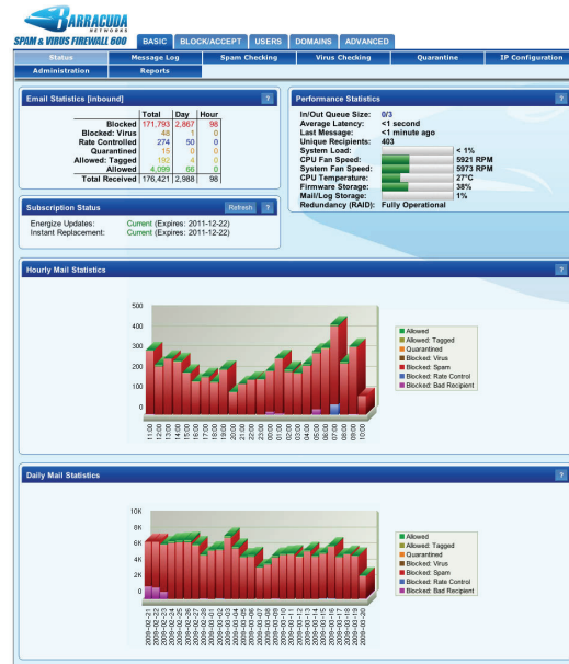
The Barracuda Spam & Virus Firewall filters all email messages and displays the number of emails received with statistics on how they were processed.

To minimize ongoing administration associated with security, the Barracuda Spam & Virus Firewall automatically receives Energize Updates for the spam definitions, virus definitions and security updates. Energize Updates are delivered automatically by Barracuda Central, an advanced technology center that works continuously to monitor and block the latest Internet threats, to combat the ever changing spam and virus variants.